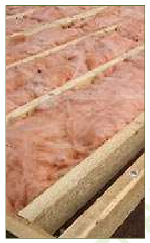
Loose fitted rockwool