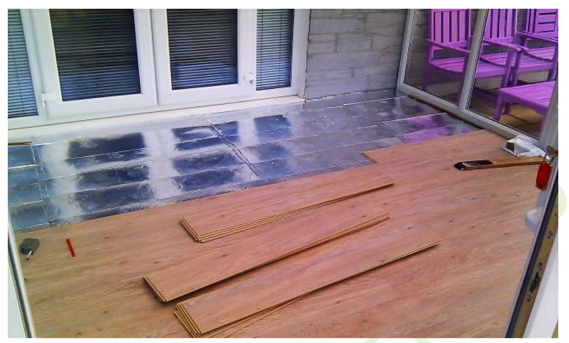
Example of insulation under laminate floor and a thin flexible insulation product on a roll (image shows 6mm Palziv product)