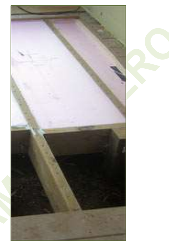
Friction-fitted rigid slab insulation

This information guide has been prepared on behalf of Barningham Net Zero by TEC Ltd, with funding from the Rural Community Energy Fund programme. The information contained has been taken from various sources and is intended as general guidance only. Further expert advice should be sought if required. Reproduction is not permitted without the prior permission of Barningham Net Zero CIC and TEC Ltd. Please contact teclimited@btinternet.com for any queries.